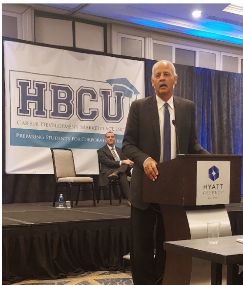
Guest Speaker: Stedman Graham