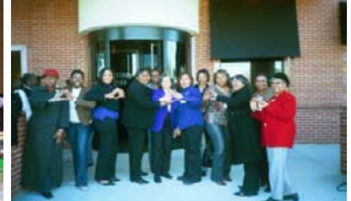
Members of Delta Sigma Theta Sorority