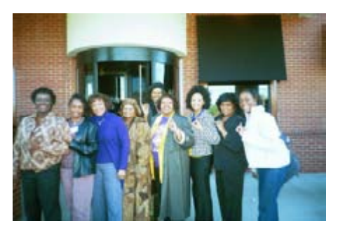
Members of Alpha Kappa Alpha Sorority