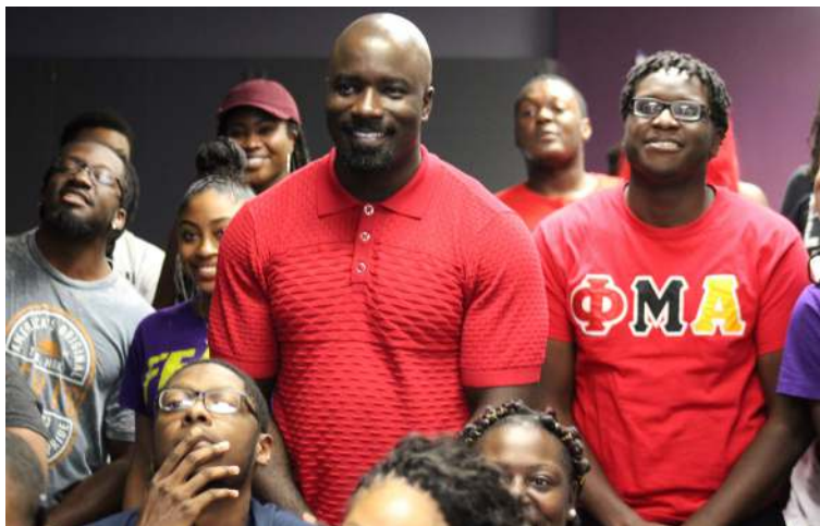
Mike Colter with mass communications students